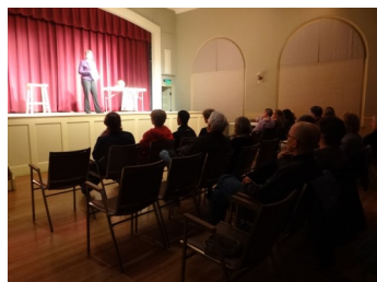
You the Man Performance at Hallowell City Hall